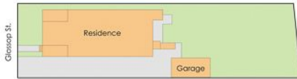
Site Plan Not to Scale