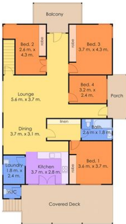
Upper Level Floor Plan Total Internal Floor Area: 135 sqm