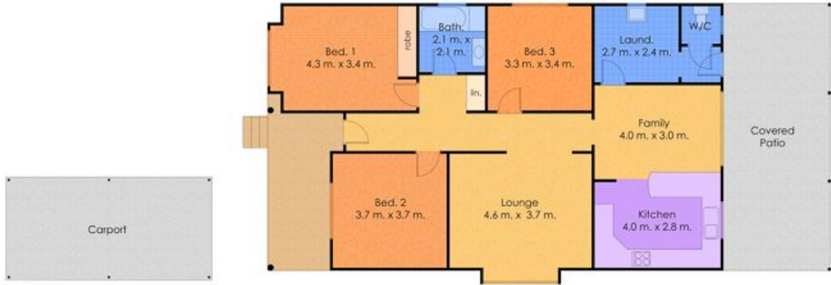
Floor Plan Total Internal Floor Area: 110 sqm