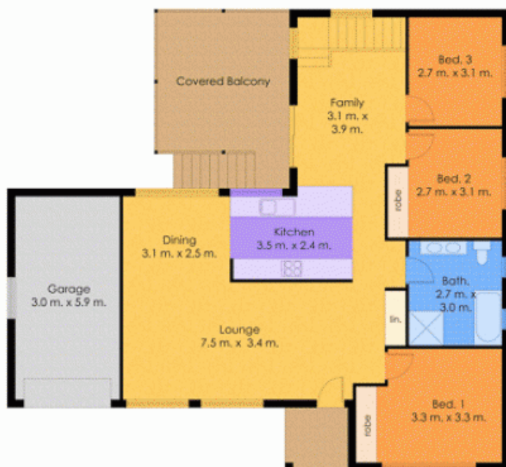
Upper Level Floor Plan Total Internal Floor Area: 148 sqm