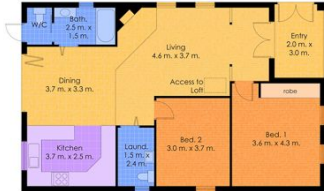
Floor Plan Total Internal Floor Area: 90 sqm