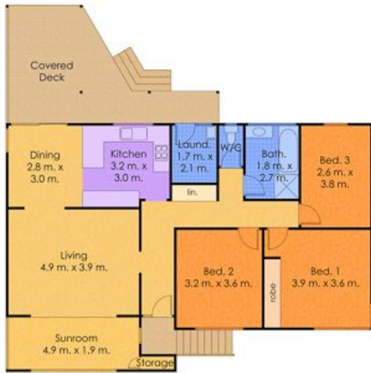
Upper Floor Plan Total Internal Floor Area: 154 sqm.