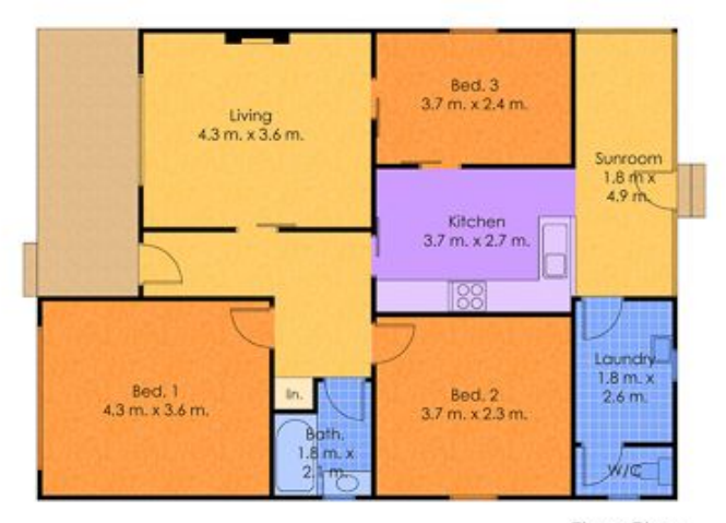
Floor Plan Total Internal Floor Area: 91 sqm