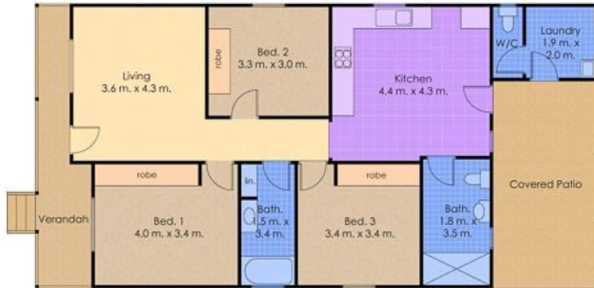
Floor Plan Total Internal Floor Area: 91 sqm