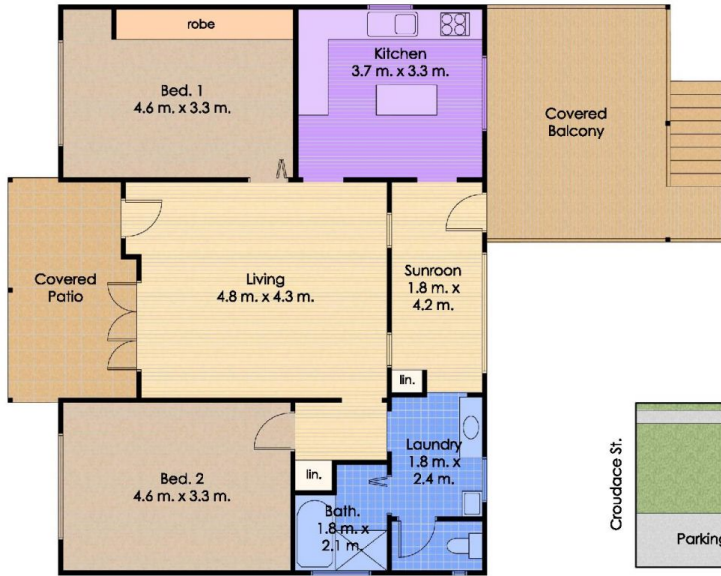
Floor Plan Total Internal Floor Area: 86 sqm