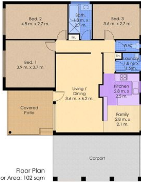
Floor Plan Total Internal Floor Area: 102 sqm