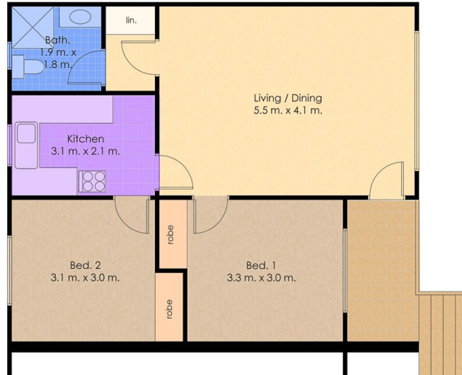
Floor Plan Total Internal Floor Area: 56 sqm