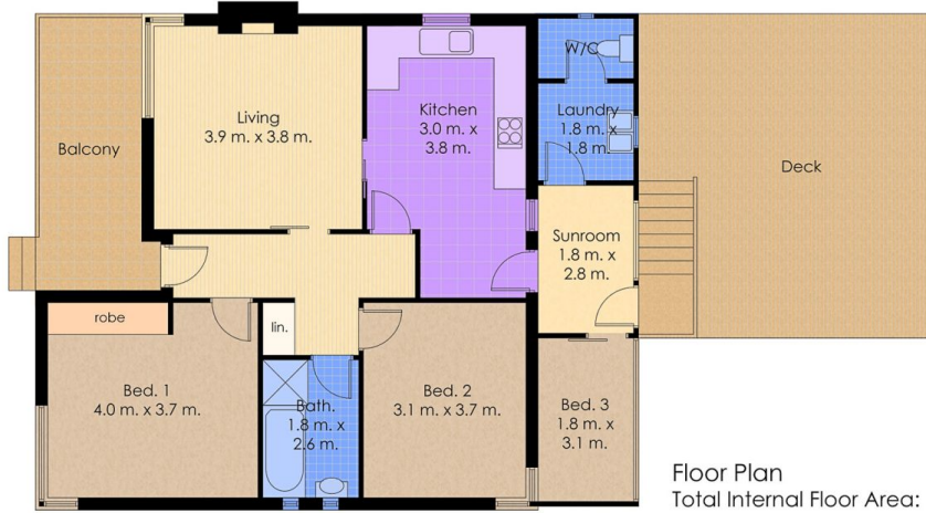
Floor Plan Total Internal Floor Area: 105 sqm