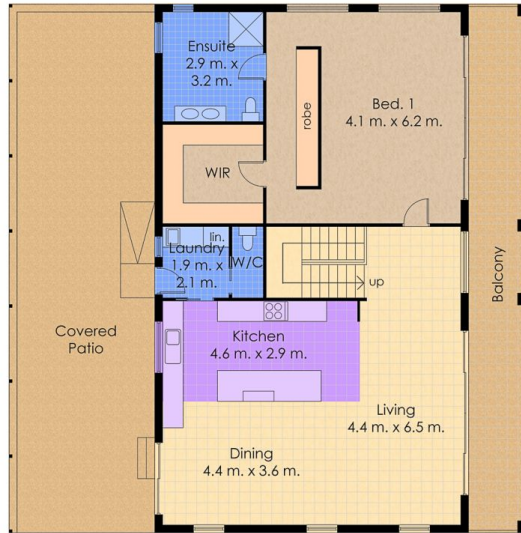
Lower Floor Plan